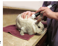
A therapeutic laser can be used to administer acupuncture.

A: For small animals, the insertion of acupuncture needles is virtually painless. Needle insertion may cause some sensation, such as tingles, cramps, or numbness which may be uncomfortable to some animals. In all animals, once the needles are in place, there should be no pain. Most animals become very relaxed and may even become sleepy.