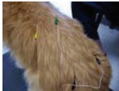
Electroacupuncture can help improve neurologic function.